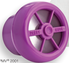
PMV® 2001 (Purple Color™)