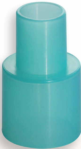
PMV-AD1522™ (Step-down Adapter)