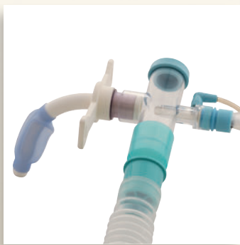
T-piece in-line suction catheter with PMV-AD1522™ Step-down Adapter, PMV® 007 (Aqua Color™)

Introducing 2 NEW Adapters from the leading manufacturer of the No-Leak speaking valve